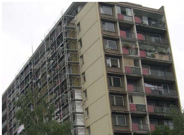
Refurbishment of a building constructed in 1973

At the moment, the average energy consumption of all buildings is 47 % higher than the accepted satisfactory levels today. The main thermal losses are caused by poorly insulated vertical wall panels and roofs, as well as by old windows.