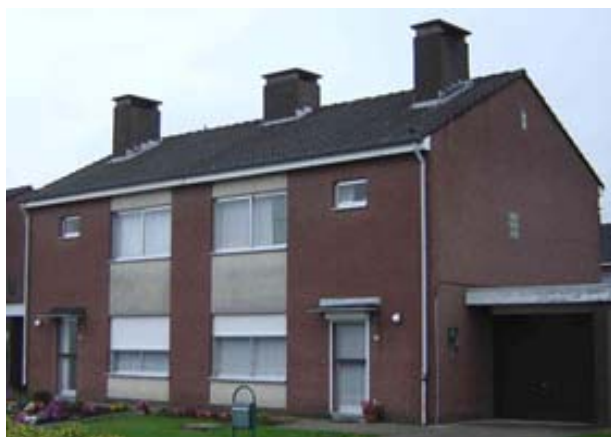
One of the renovated buildings

The renovation began in November 2007 and will be finished before the end of this winter. The main energy savings will come from roof insulation, insulation of some facades, new windows, removal of cold bridges, and installation of a ventilation system.